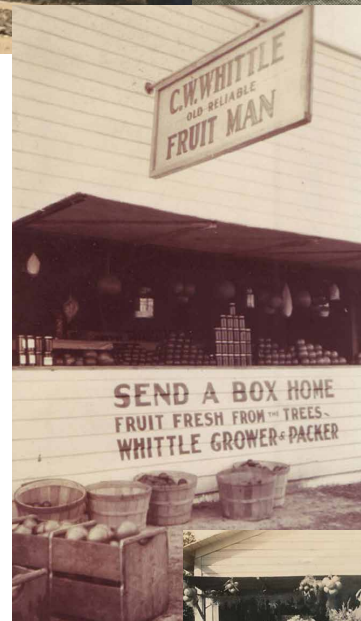
Fruit stand in front of the Whittle House